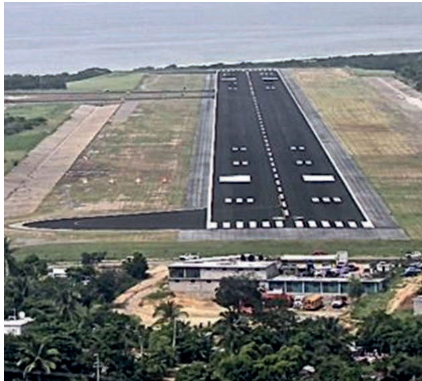
Airport of Puerto Escondido

a) By air: very well connected with Mexico City, with daily flights offered by Viva Aerobús, Aeromar, Interjet and Volaris; from Guadalajara, twice a week flights available with Volaris; daily flights from the city Oaxaca with Aerotucán and Aeromar. Huatulco's airport, 1 hour away by land from Puerto Escondido, has numerous additional airline connections to Mexico City and other Mexican cities. Transportation from the hotel, to and from Huatulco's airport, is available through the travel agencies located on the Posada Real premises.