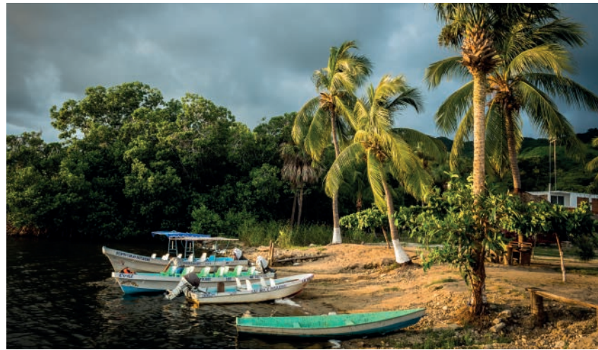
Laguna de Manialtepec

An adventure going up the Manialtepec River on horseback, along the slopes of the low mountain jungle, to a natural sprout of sulfurous waters where you can take a relaxing and medicinal bath.