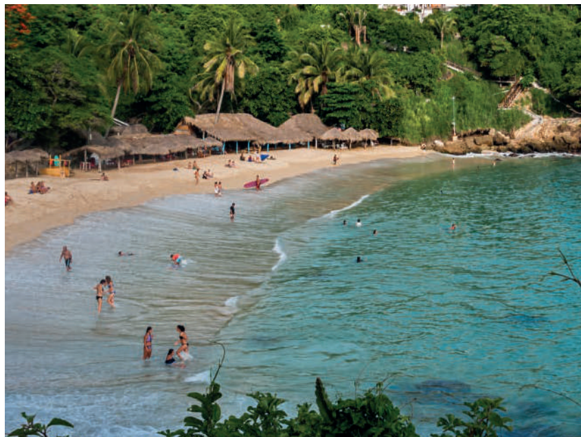
Playa Puerto Angelito

Puerto Escondido is an authentic Mexican fishing village, located on the Oaxacan "Emerald Coast", a natural coastal paradise between Acapulco and Huatulco. This destination offers unique attractions for all.